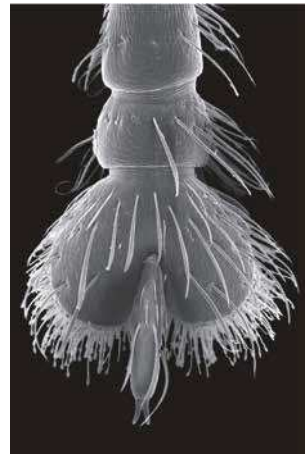
Fig. 1. Biological screw in a beetle's leg

The first originator is generally attributed to Arsytas of Tarentum (about 428 BC), Archimedes (about 287 BC) or Leonardo da Vinci (1452 - 1519). But the greatest development occurred in the 18th century during the technical revolution. Without screws, industrial revolution would not be possible, because all the machines would disintegrate into individual parts of which they were assembled. The screws enabled the rapid development of road (Fig. 5) and rail transport (Fig. 6), too.