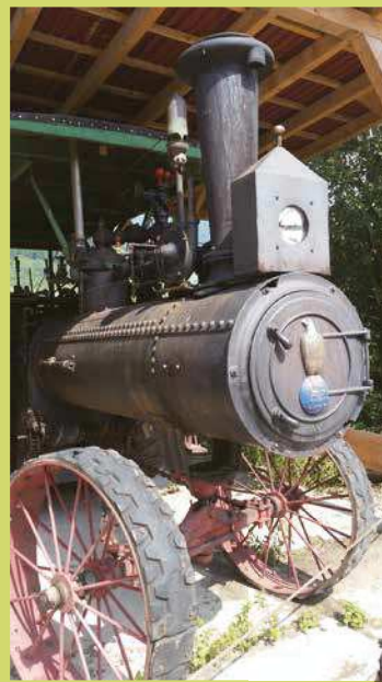
Fig. 5. Watt Steam Engine

The first industrial screws were made of wood (Fig. 7). At present, it is steel with a strength of 800 - 1400N/mm 2 , stainless steel with high corrosion resistance and at the same time high mechanical properties (martensitic stainless steel), brass, Cu and aluminum. Ti alloys are used for special purposes.