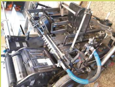
Fig. 3. Guttenberg Movable-type Printing