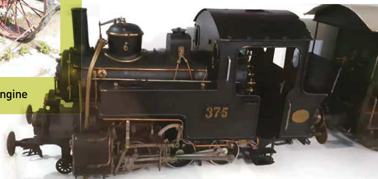
Fig. 6. Rail Transport

Henry Maudslay (1771 – 1831), Joseph Whitworth (1803 - 1887), William Sellers (1827 – 1905) and many unnamed pioneers have contributed to the fact that screw, based on the spiral is currently one of the most common elements used in construction and machine design to