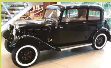
Fig. 4. Ford Car